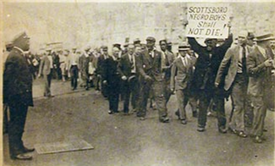
(THE SCOTTSBORO CASE)